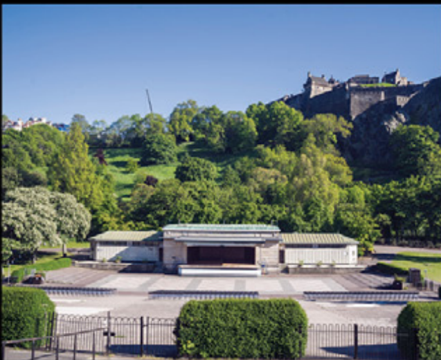
Princes St Gardens