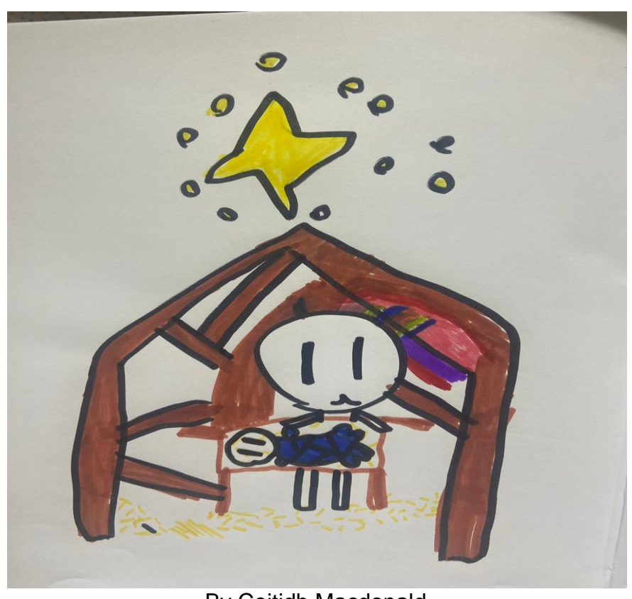
By Ceitidh Macdonald